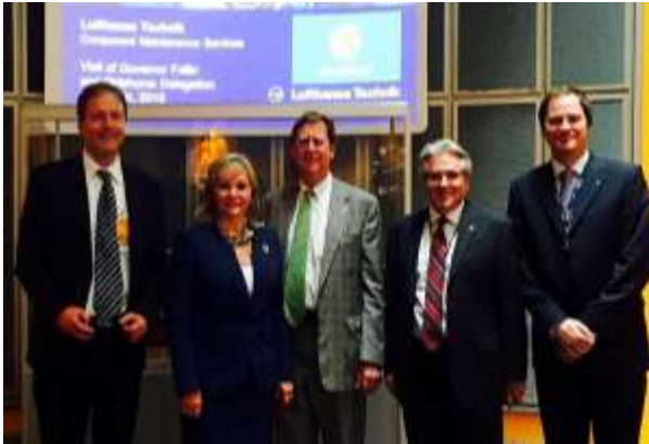
Governor with Lufthansa Technik officials in Germany

Gov. Mary Fallin led a delegation of Commerce Department and business executives on a European business mission in June. The Governor conducted business prospect calls with key executives and provided support to Oklahoma companies who were exhibiting at the world's largest air show in Paris. The Governor also met with aerospace and energy executives in Germany and Italy.