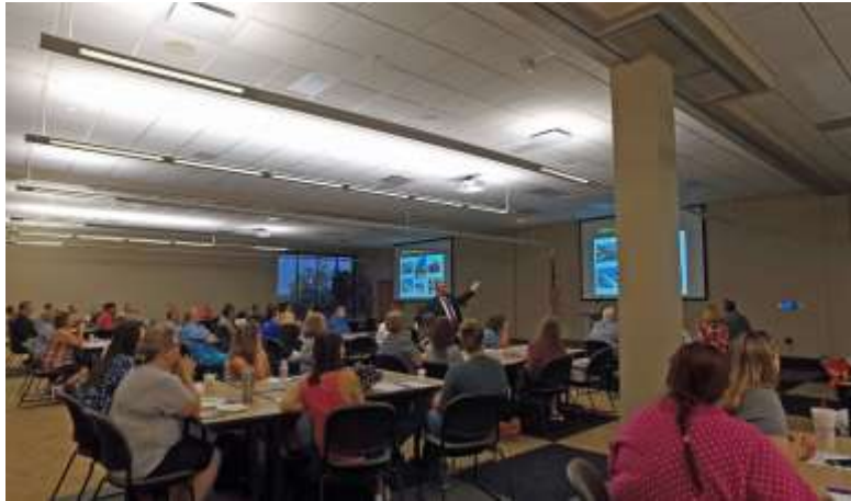
STEM Training Session at Francis Tuttle Career Tech, OKC

In an effort to grow relevance and interest of STEM careers with key student age groups, the Roundtable supported three professional development events in June/July in Oklahoma City, Lawton and Tulsa.