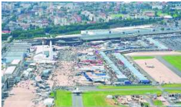
Aerial photo of the 52 nd International Paris Air Show Exhibition Center of Le Bourget

Governor Mary Fallin joined a working team of state economic developers and company officials at the aerospace industry's premier event in Paris in June. Discussions were held with high-level executives from aerospace companies based across the globe. The air show brought together industry players from around the world, showcasing the latest technological innovations in aviation and defense. Over 351,000 visitors from 50 countries participated. Roundtable support was utilized for the event.