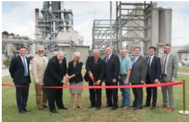
Holcim U.S Cement plant in Ada Completes $100 Million Modernization in June.

Other major expansion/investments include Webco, Sand Springs ($70 million); Kodak, Weatherford; Semgroup, Woods & Blaine counties; Union Pacific, statewide; Tierpoint, Oklahoma City; Omni Air, Tulsa; Alfa Laval, Broken Arrow; Xcaliber, Pryor and OGE/Solar, Covington.