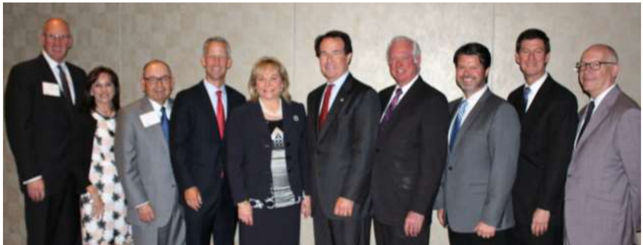
Roundtable Board at Tulsa Annual Meeting in June.