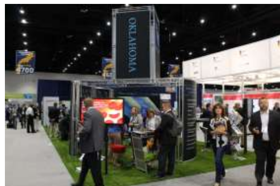
Oklahoma Trade Booth at BIO International Convention June 19-22 – San Diego

Approximately 16,123 biotech leaders from around the globe attended the 2017 BIO International Conference in San Diego, CA. The OKBio delegation consisted of 36 delegates from 21 Oklahoma organizations/companies. The delegates attended 140 meetings with potential partners in research, funding, etc. The team made contact with over 1000 people at the booth over the course of the conference. A reception was held at the Hilton San Diego Gaslamp Quarter, which attracted over 100 attendees. The Roundtable was a supporter of this event.