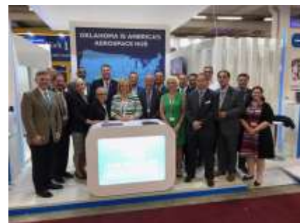
Gov. Fallin and OK Business Development Team at Paris Air Show